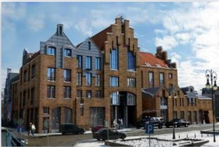
Old Town City Hall, ul. Stary Rynek 25, 82-300 Elbląg, Poland