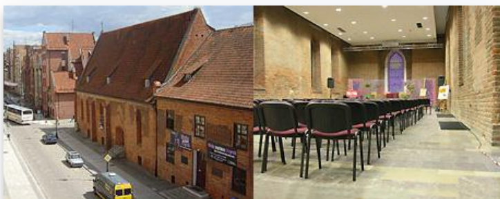
Cyprian Norwid Library, ul Świętego Ducha 3-7